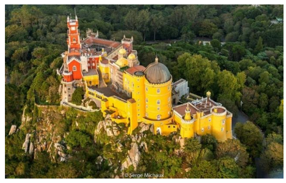
28th April. | Visit to Sintra. Meeting point Sintra railway station