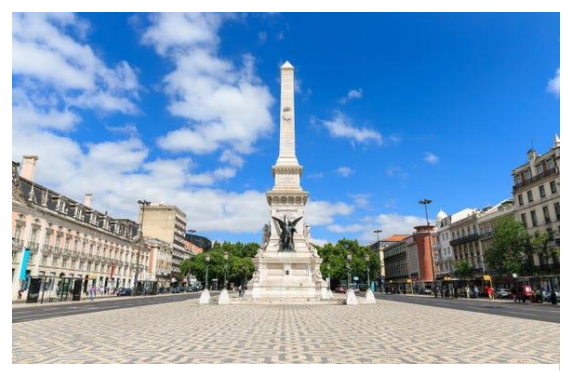
27th April | Visit to Lisbon. Meeting point: Restauradores

Take the train to Sintra at: Benfica railway station at 8h24, or Rossio railway station at 8h31, or Entrecampos railway station at 8h47 Meeting point: Sintra railway station at 9h30