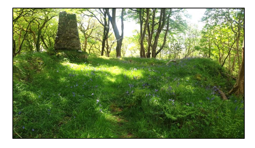
GRETB Training garden Developed an organic horticulture programme All classes take place outside and in the poly tunnel A lot of learning in biodiversity, recycling, plant and species life, sustainability